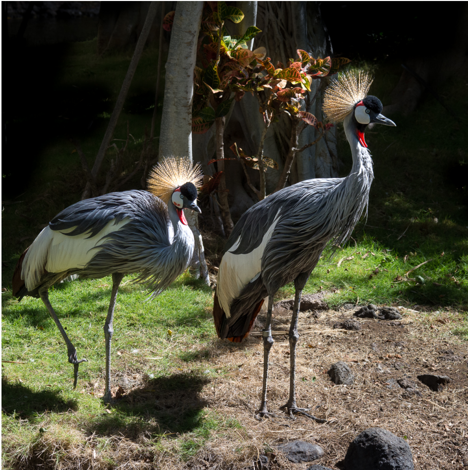
March Raw Challenge Entry