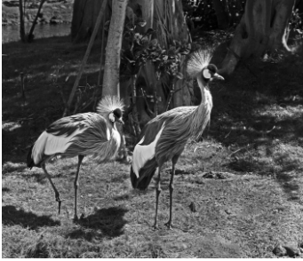
March 2024 Raw Image Challenge Accepted Brenton Elsey