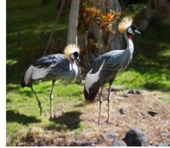
March 2024 Raw Image Challenge Accepted Beryl Elsey