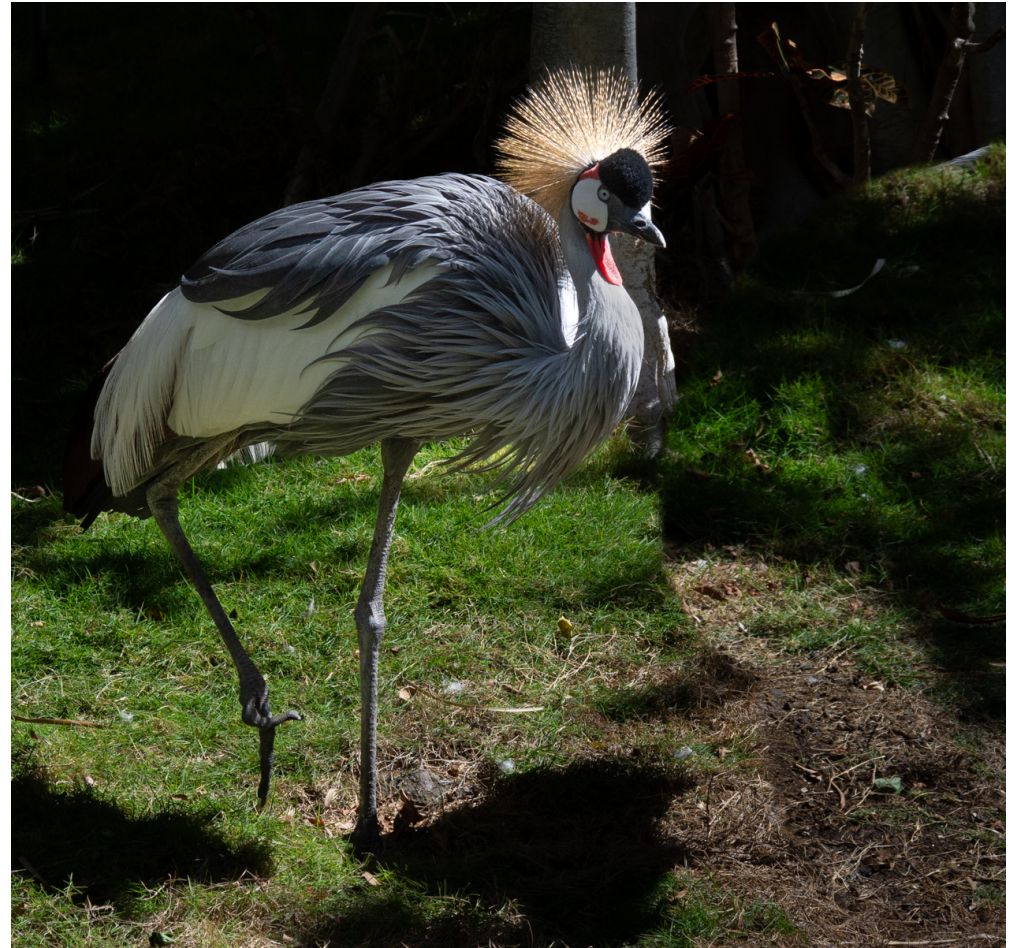
March 2024 RIC