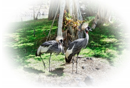
March2024RawImageChallenge Accepted Bronwyn Dunstone